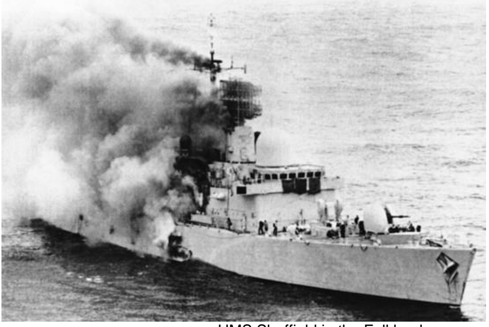
HMS Sheffield in the Falklands

The conflict began on 2 April, when "Argentina invaded" and "occupied the Falkland Islands", followed by the invasion of South Georgia the next day. On 5 April, the British government dispatched a naval task force to engage the Argentine Navy and Air Force before making an amphibious assault on the islands. The conflict lasted 74 days and ended with an Argentine surrender on 14 June, returning the islands to British control. In total, 649 Argentine military personnel, 255 British military personnel, and three Falkland Islanders died during the hostilities. The conflict was a major episode in the protracted dispute over the territories' sovereignty. Argentina asserted (and maintains) that the islands are Argentine territory, and the Argentine government thus characterised its military action as the reclamation of its own territory. The British government regarded the action as an invasion of a territory that had been a Crown colony since 1841. Falkland Islanders, who have inhabited the islands since the early 19th century, are predominantly descendants of British settlers, and strongly favour British sovereignty. Neither state officially declared war, although both governments declared the Islands a war zone.